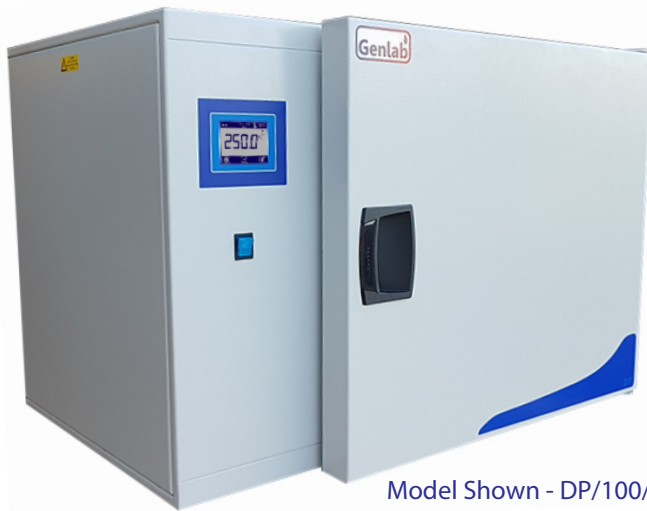
Model Shown - DP/100/TDIG/F