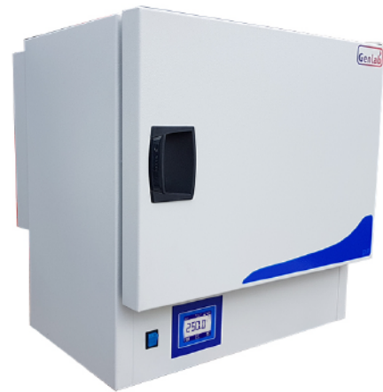
Model Shown - MINIS/50/TDIG/F

The Genlab range of Dual Purpose Ovens / Incubators combine the advantage of two temperature ranges in the same unit. Using bespoke firmware designed specifically for this chamber size, and a calibration class temperature sensor, we can offer accurate control up to 250.0 °C without temperature overshoot. The same chamber can also maintain a steady 30.0°C* constant temperature by simply adjusting the set point. Available in a variety of sizes and designed with both side or base mounted displays to suit your exact needs.