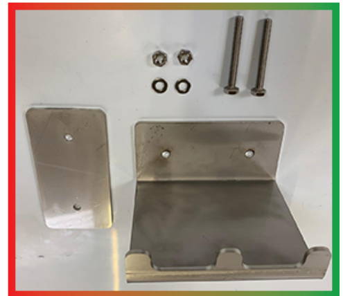
*Thicker connection kits available

They can be installed internally, or, on external doors and fully waterproof. Supplied with connection kit to suit doors up to 50mm* thick and installed in less than 2 minutes per door. OEM custom branding and powder coating also available.