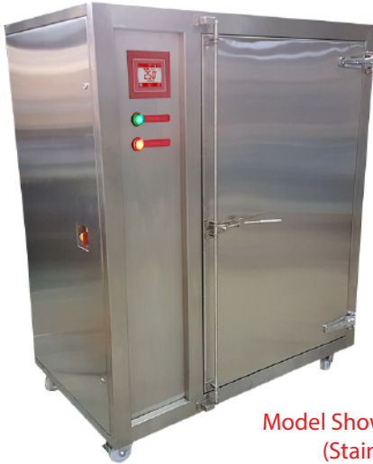
Model Shown - PRO/750V/TDIG/SSE (Stainless Steel Exterior)