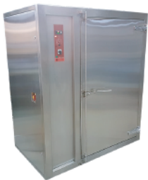
Stainless Steel Ovens