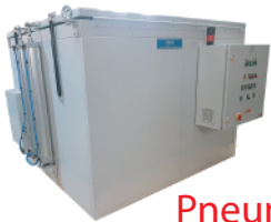
Pneumatic Opening Ovens