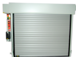
Roller Shutter Ovens