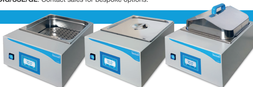
Supplied with no lid