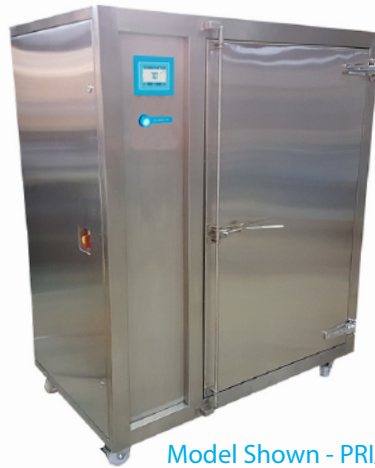
Model Shown - PRI/750V/TDIG/SSE (Stainless Steel Exterior)