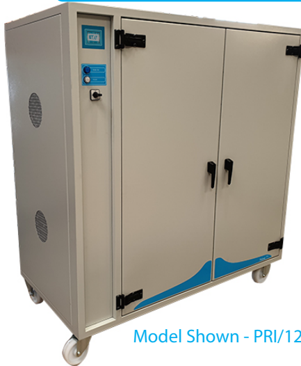
Model Shown - PRI/1250H/TDIG