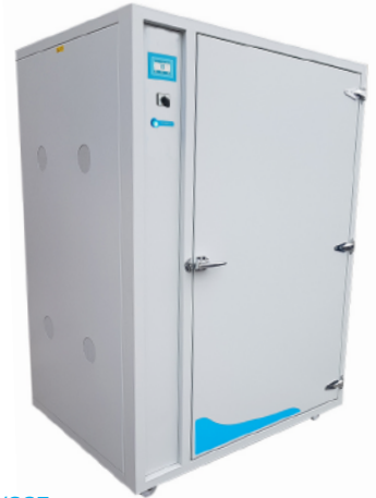
Model Shown - PRI/650V/TDIG

This range of Prime XL Incubators are the flagship brand of Genlab Incubators. They are built to the highest standards and packed with features and enhancements. As standard, the Prime XL range offers a mirror polished stainless steel interior, increased accuracies and an extended temperature range of 100.0°C. Built around a heavy duty panelled framework, we can offer increased load capability in this range and multiple reinforced shelves. It features our latest touch screen control system which offers intuitive control designed for laboratory and industrial incubators.