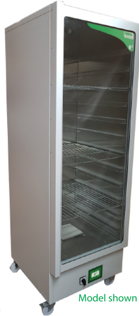
Model shown E3DWC425/F/TDIG