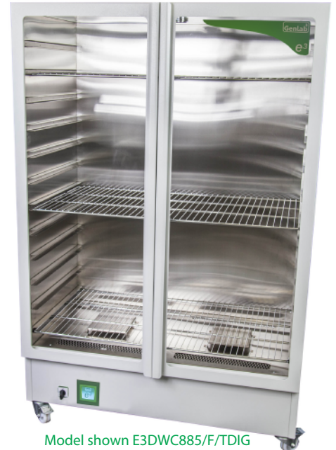
Model shown E3DWC885/F/TDIG

Genlab is proud to offer their customers a unique range of sustainable laboratory products and services. e 3 is our market leading brand for scientifically developed, cutting edge, sustainable, eco-friendly products. Genlab's new e 3 range of glassware drying cabinets are energy efficient, safer and economic to run. Working with the University of Cambridge, we developed units that represent a novel, sustainable solution to glassware drying. They feature our latest touch screen control system, which offers intuitive control and excellent accuracies with bespoke firmware for energy saving control, including adjustable automatic on/off times.