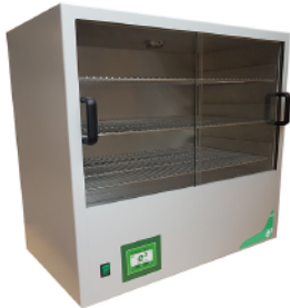
Model shown E3DWC100N/TDIG