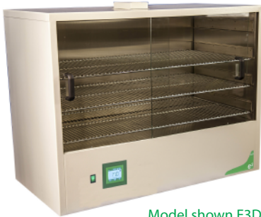
Model shown E3DWC200N/TDIG