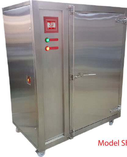
Model Shown - PSS/750V/TDIG