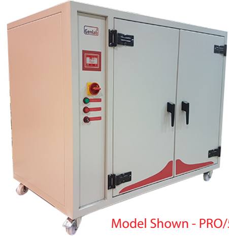
Model Shown - PRO/500H/TDIG

This range of Prime XL Ovens are the flagship brand of Genlab Ovens. These are built to the highest standards and packed with features and enhancements. As standard, the Prime XL range offers heavy duty stainless steel interior, increased accuracies on our standard models and are quicker responding. Built around a heavy duty panelled framework, we can offer increased load capability in this range, multiple reinforced shelves and operate at 300°C continuously. They feature our latest touch screen control system which offers intuitive control designed for industrial ovens.